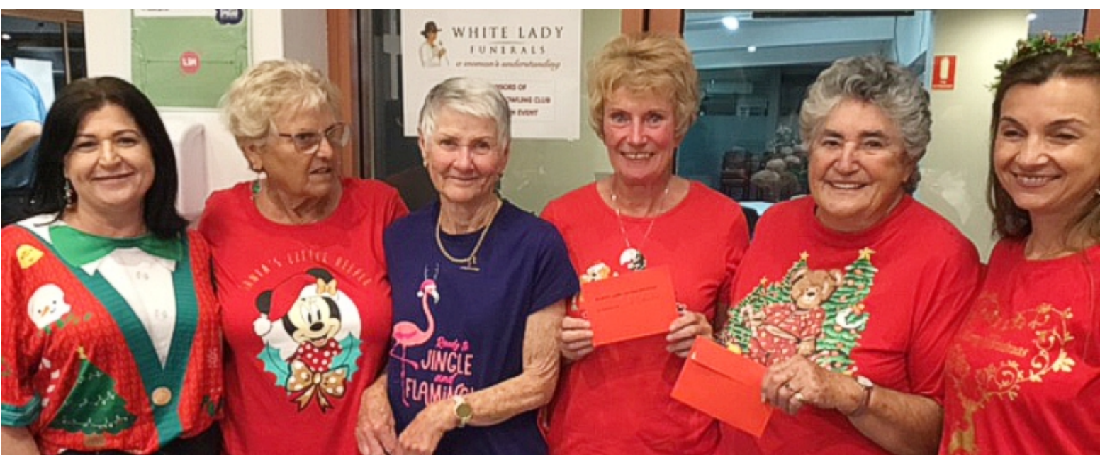
Above: Belmont Golf and Bowls Invitation Day Runners-up - Halekulani