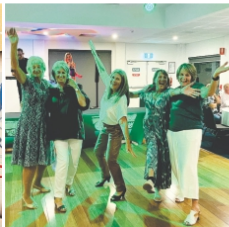
Above: On the dance floor at Nelson Bay's presentation night