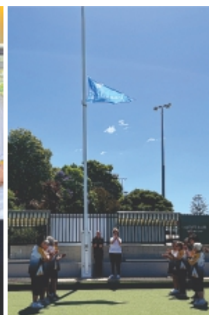
Above: On the Green Unfurling Charlestown Women's No. 1 Division Pennant Flag