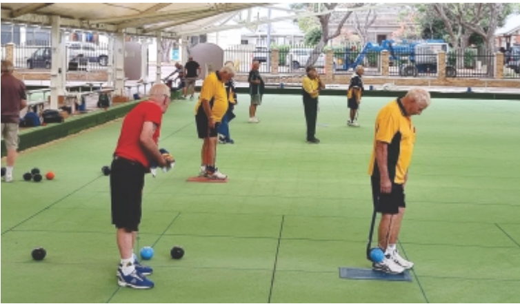
Above: Players on the green at RSL Zone 6 Annual Christmas Social Day at Raymond Terrace