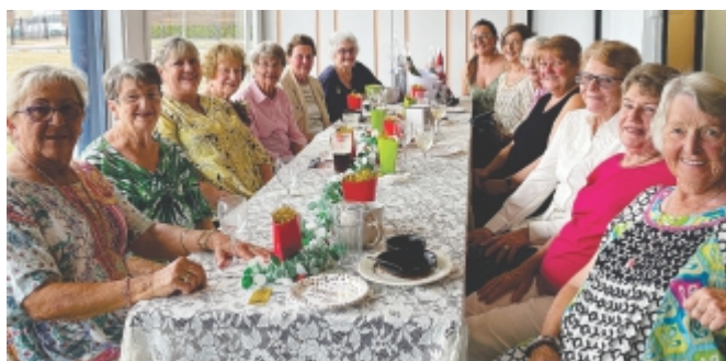
Above: Alder Park ladies enjoying their annual Christmas get together.