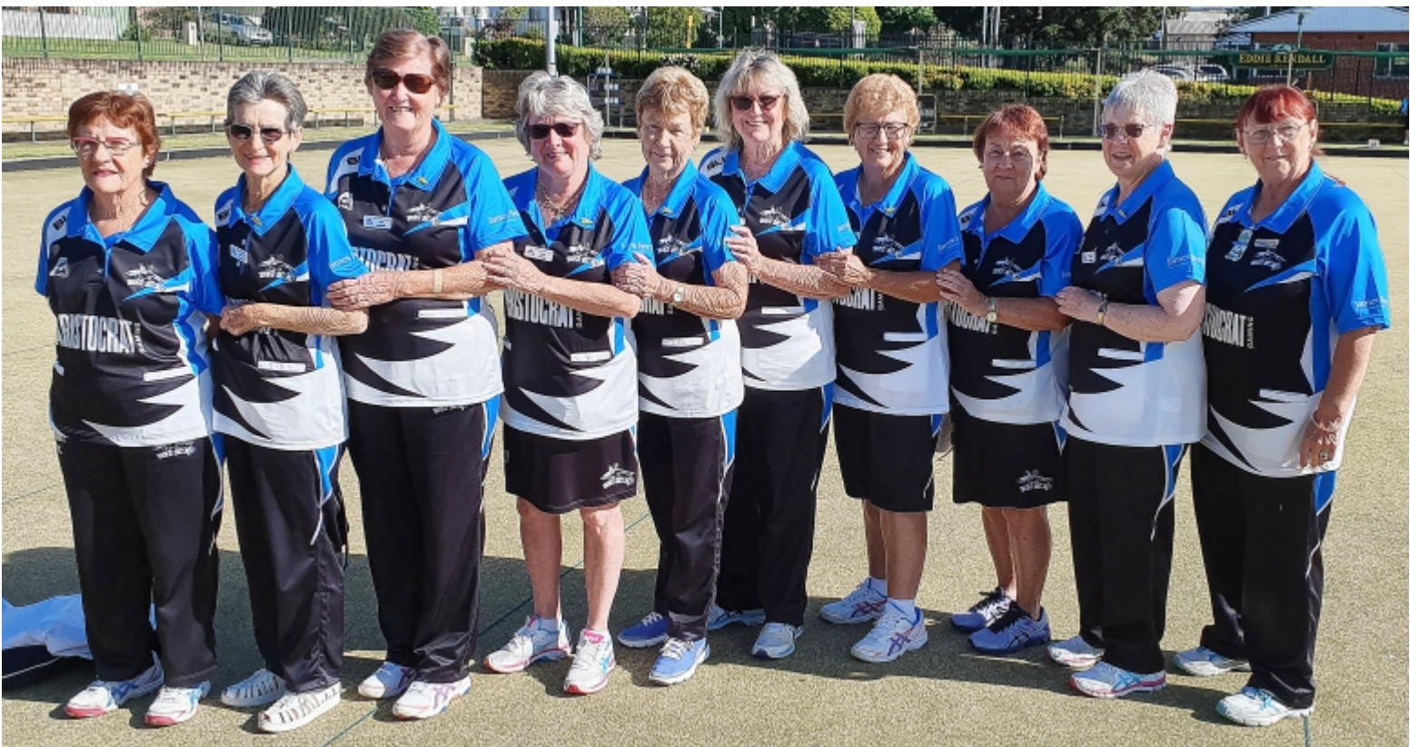
Above: Beresfield Women's State Pennant team Grade 3 Team 2