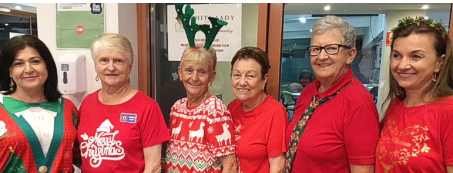
Above: Belmont Golf and Bowls Invitation Day Third Place getters - Boolaroo