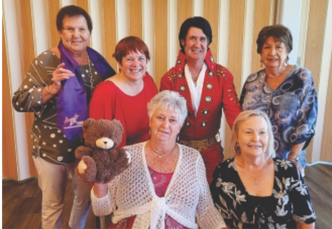
Above: Christmas celebrations at Redhead