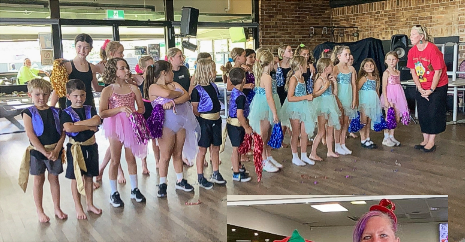
Above: Marks Point Women's Christmas Party Entertainment ....the lovely children from Marks Point