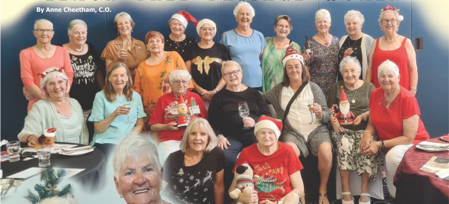
Above: 2022 Lemon Tree Passage Women's Christmas Party