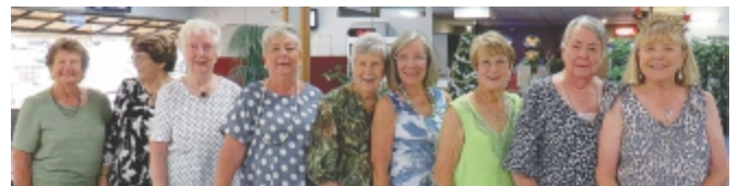
Above: Some happy faces at Lambton Park Women's Xmas Luncheon

Welcome back ladies. Hope you all had a great Christmas. Our Christmas luncheon was lovely. Lots of chatter and everyone had a fun day. Now it's time to address the new year and all it holds.