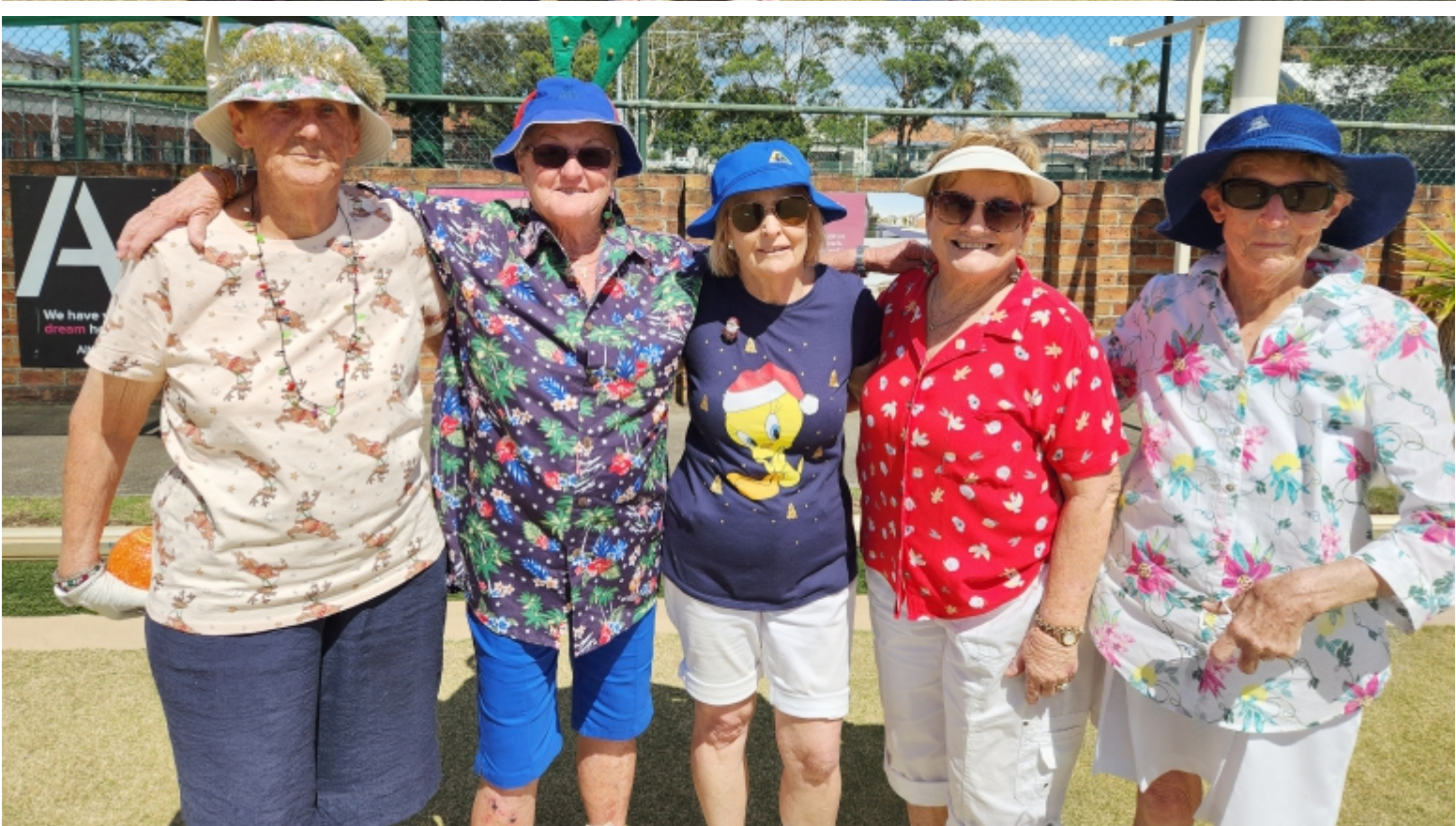
Above: Christmas celebrations at Redhead