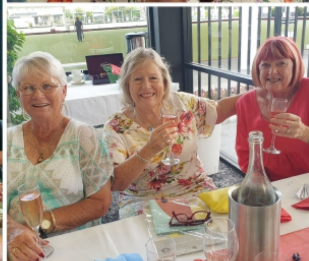
Above: Christmas party shenanigans.