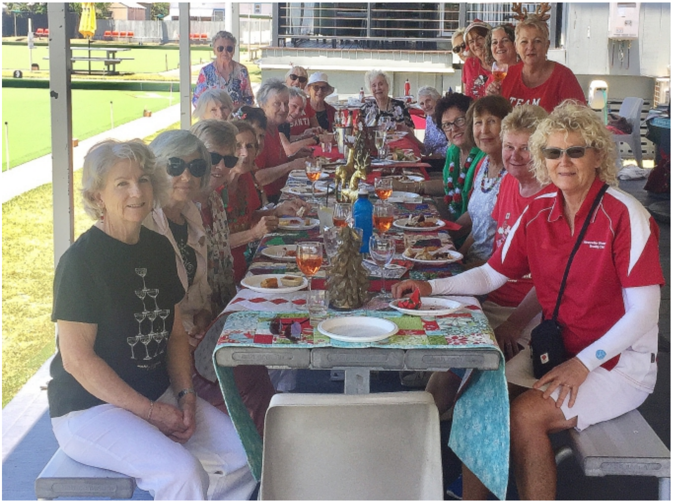
Above: Merewether Ladies Xmas Shindig