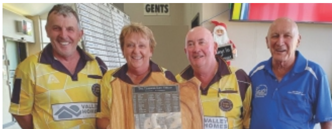
Above: Lorn Park Farmers Day Winners