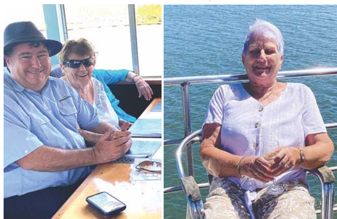
Above: Adamstown members enjoy a day trip on the Postmans' Boat in the Central Coast