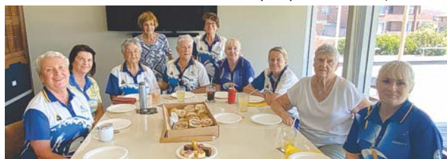
Left: Bar Beach Ladies Luncheon

Hello Bowlers! Our Ladies started 2023 off with a bang partaking of a happy lunch after the gala provided by our club. Much catching up was done before the entries for the Club Pairs were placed on the board.