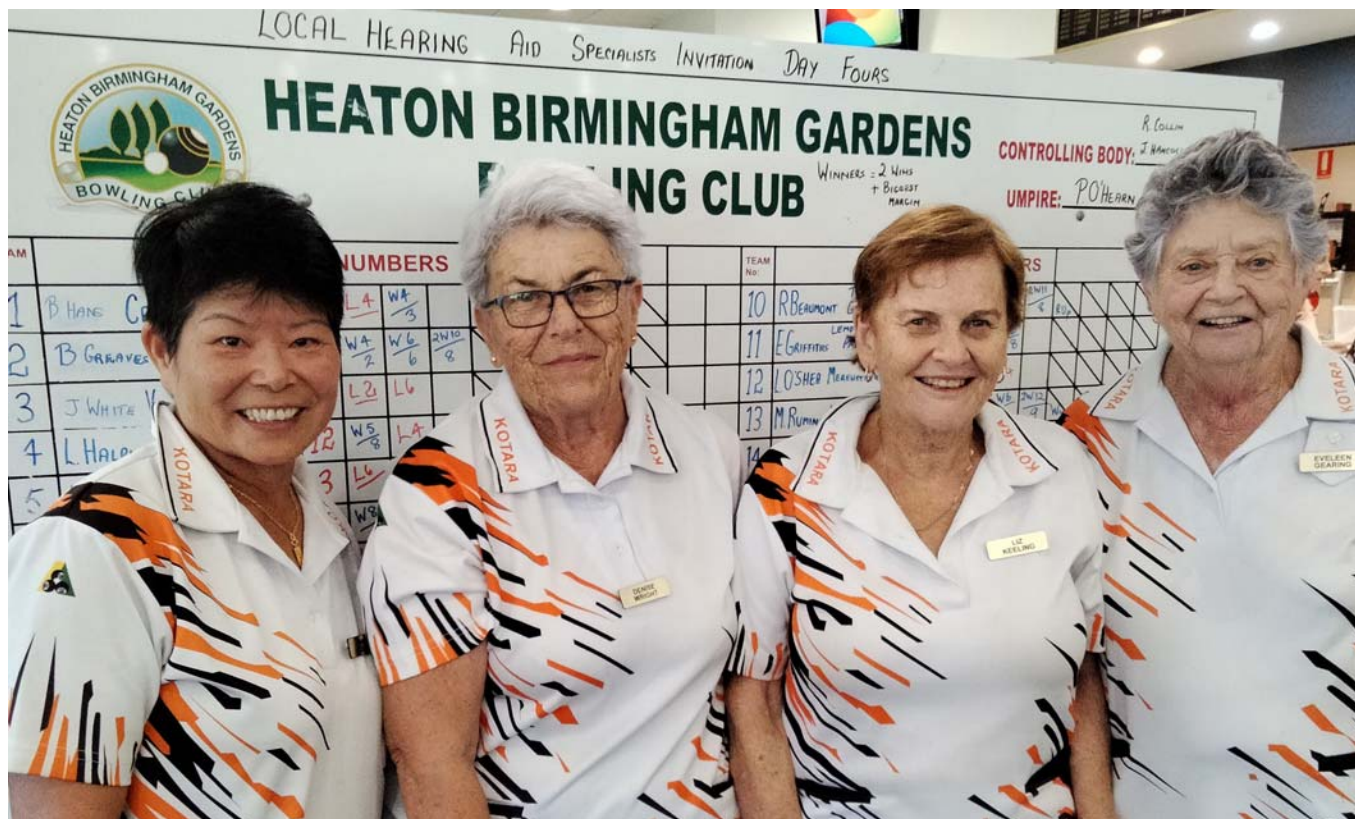
Above: Consolation in Jesmond Women's Local Hearing Aid Specialists Invitation Fours Day - Kotara