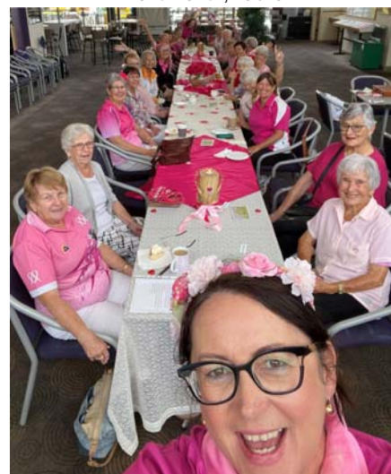
Above: Charlestown Ladies at table