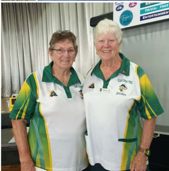
Above: Solders Point Women's Prestige Pairs 3 rd to 6 th place getters.