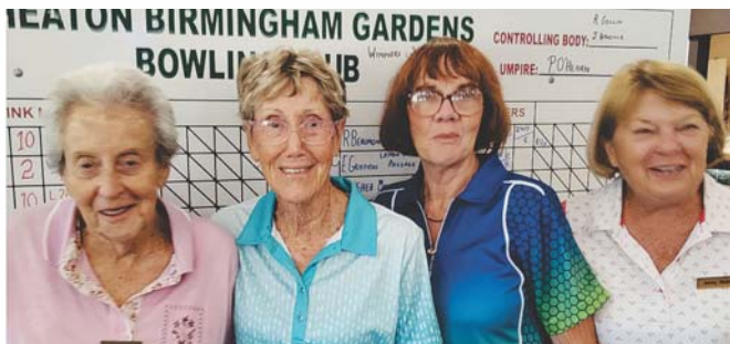
Above: Winners of Jesmond Women's Local Hearing Aid Specialists Invitation Fours Day - Wallsend