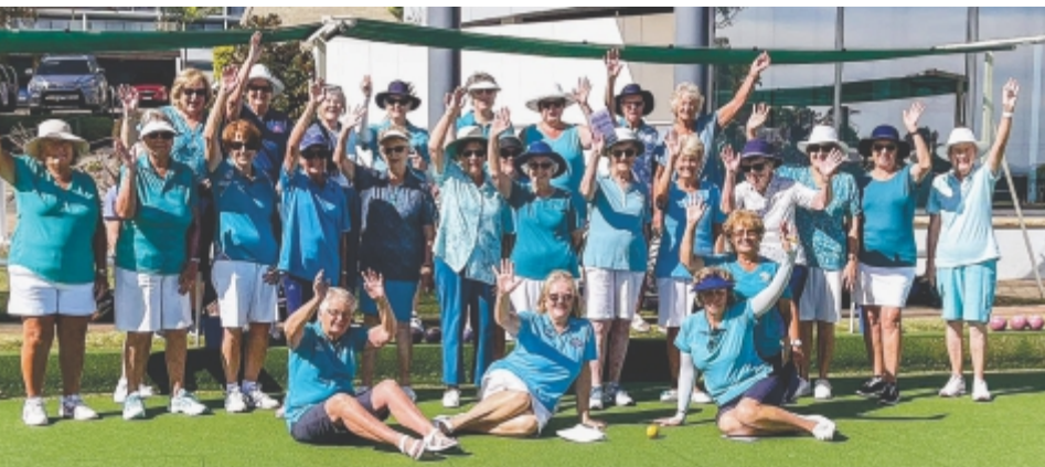
Above: Teal Day at Nelson Bay

Well done NBWBC for raising a generous amount of $600 at our annual fund raising charity event. Great effort ladies!