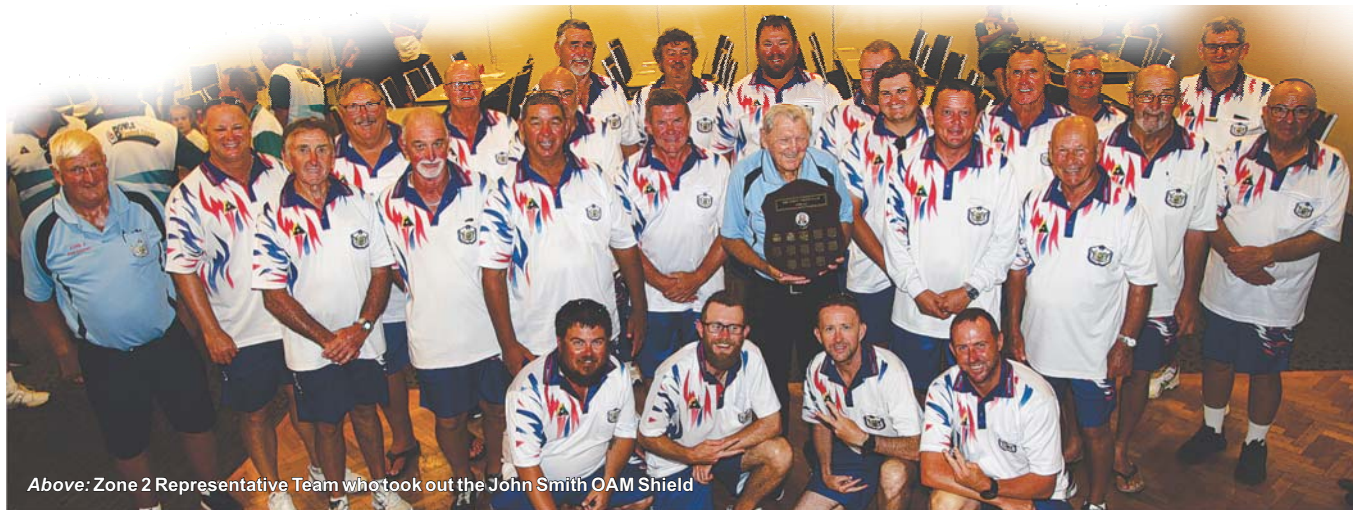
Above: Zone 2 Representative Team who took out the John Smith OAM Shield