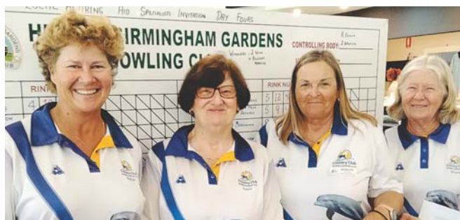
Above: Runners Up in Jesmond Women's Local Hearing Aid Specialists Invitation Fours Day - Tea Gardens

As you can see we have had a name change at our Club. Because the suburbs of Heaton and Birmingham Gardens are no longer relevant in proximity to our club, it has been difficult for patrons and players to find us if they are not familiar with our location. Hence the decision to now be known as Jesmond Bowling Club.