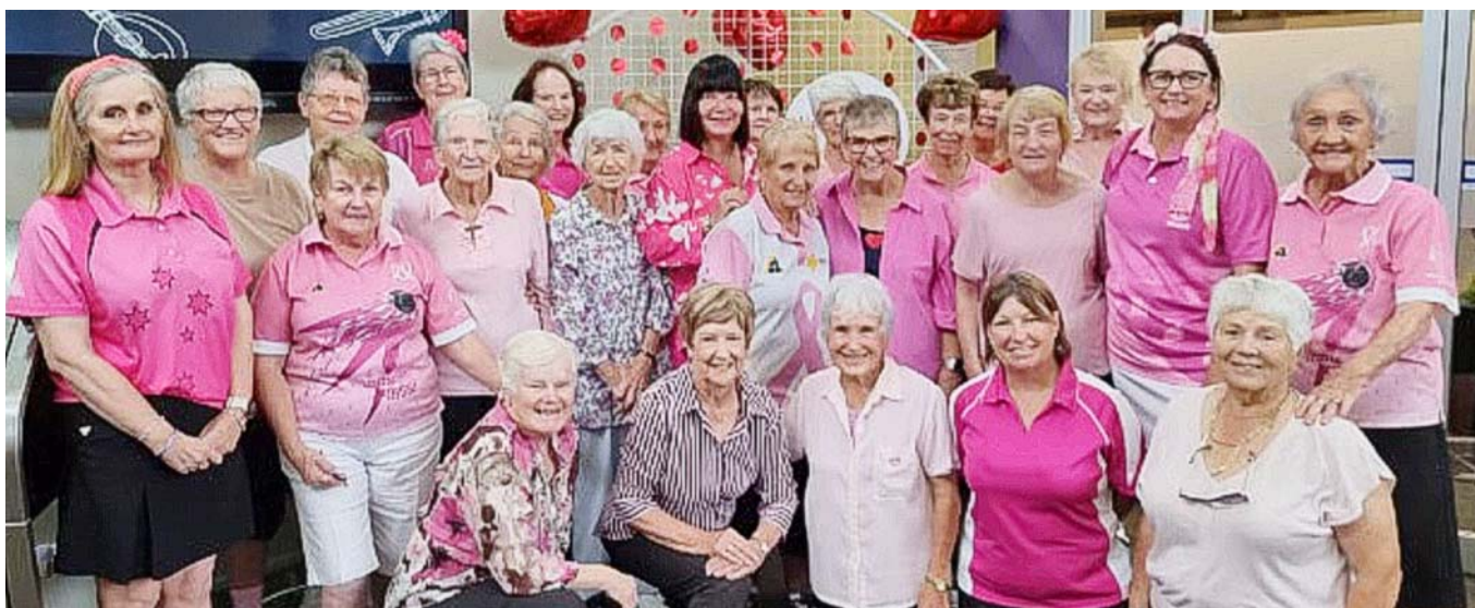
Above: Charlestown Ladies Valentines Day Celebrations Group photo