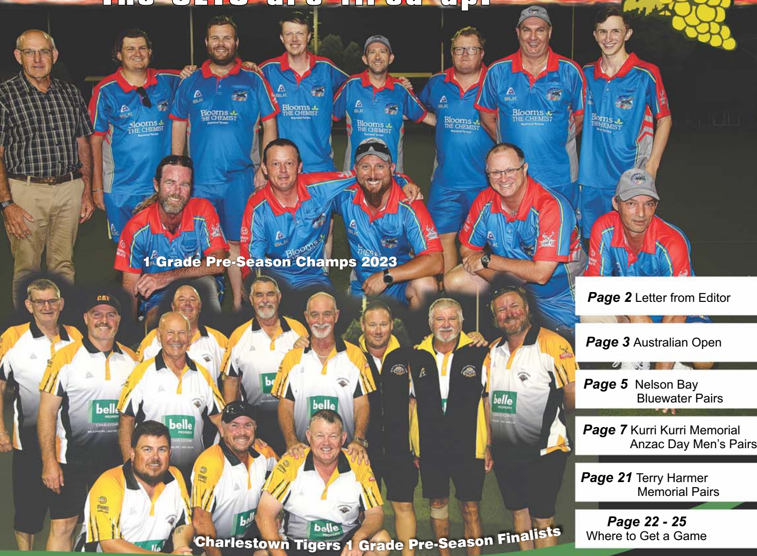
1 Grade Pre-Season Champs 2023