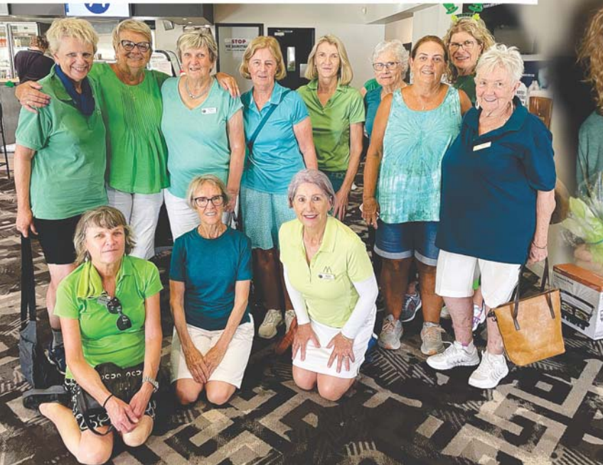
Above: The Lowlands girls getting into the Green theme on St Patrick's day at Wallsend BC invitational day.