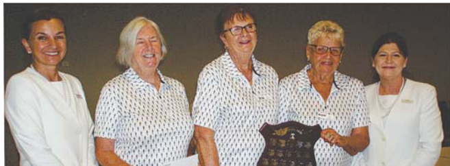
Above: KAHIBAH WATERFALL TRIPLES Sponsored By: White Lady Funerals - Winner: Belmont