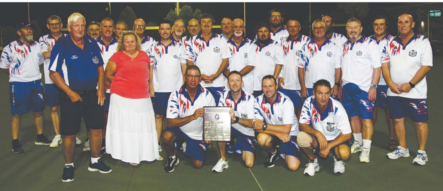
Above: Zone 2 Rep side overall winners of the Rod Robards Shield.