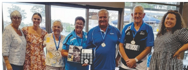
Above: Inaugural Black Duck Shield Day at Beresfield.