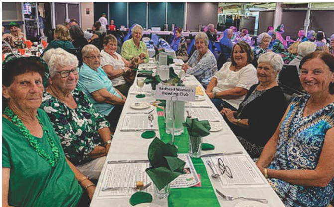
Above: Redhead ladies celebrate St Pats Day