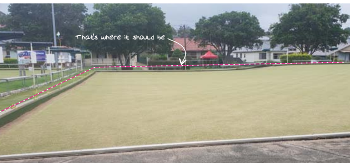
Above: Wallsend Diggers Sports Bowling Club Green collapsed from mine subsidence.