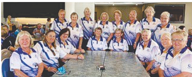
Above: TGWBC teams at Tuncurry-Forster WBC Open Fours Carnival