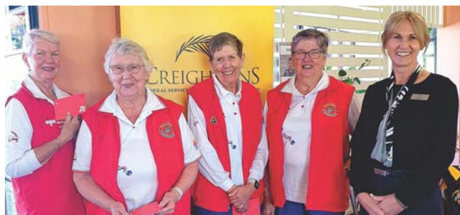
Above: Runners-up in Boolaroo Women's Invitation Day - Boolaroo

With Winter upon us, enjoy your bowls, stay well and warm.