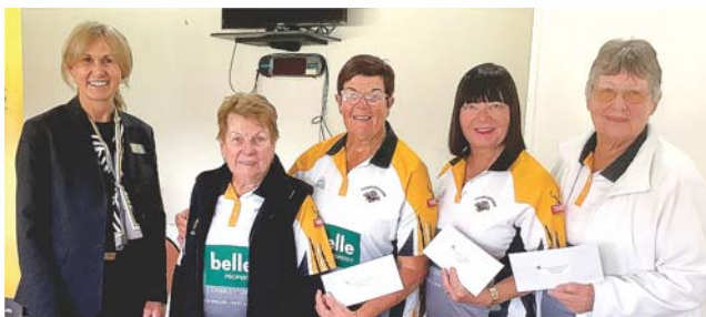
Left: Charlestown - Winners of Wangi Women's Invitation Day sponsored by Creightons Funerals