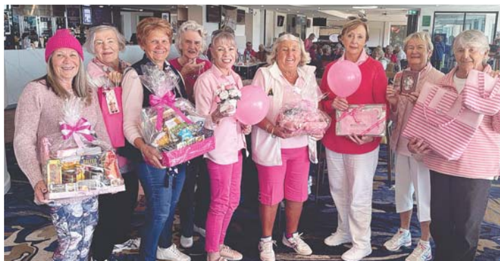
Above: Raffle Prize winners

2023-24 CONDITIONS OF PLAY – These should be released soon. Umpires should obtain a copy and check out any changes that have been made. A copy of the Conditions of Play together with a copy of the recently released Laws of the Sport of Bowls Crystal Mark 4 th Edition April 2023 should be placed in your Umpires Kit. (Copies of the law Book are available from the Association Office at a cost of $14 each).