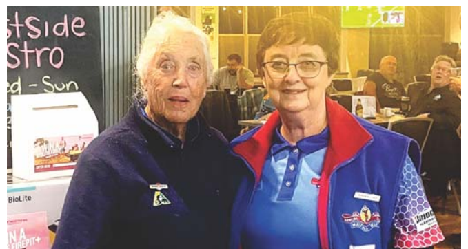
Above: Mayfield West Pairs Tournament JOINT winners Charlestown and MayWest