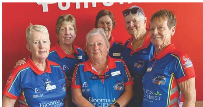
Above: Raymond Terrace Women teams that played at Merewether's Invitation Day.

Two teams of Raymond Terrace ladies played in the Merewether Invitation Day at the beginning of May, everyone had a great day and met up with lots of lovely ladies again.