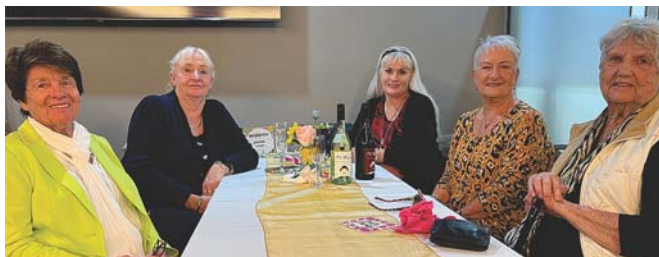
Above: Bar Beach ladies at Charlestown Oncology Day