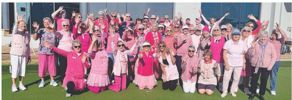
Below: Players at Nelson Bay for Tomaree Ladies Breast Cancer Support Group