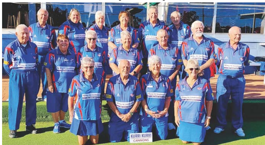
Above: Kurri Kurri 7 grade post sectional team

Our 1 grade, have qualified for state after running second in our section. Also our 1s will come Zone 6 flag winners. Congratulations