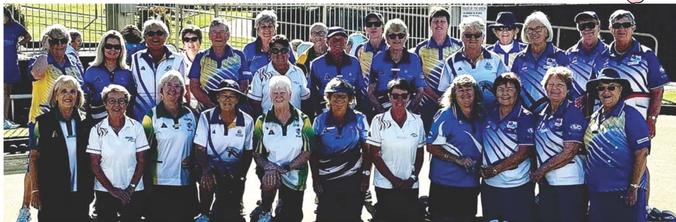
Above: Newcastle District Women's "Coast" Team