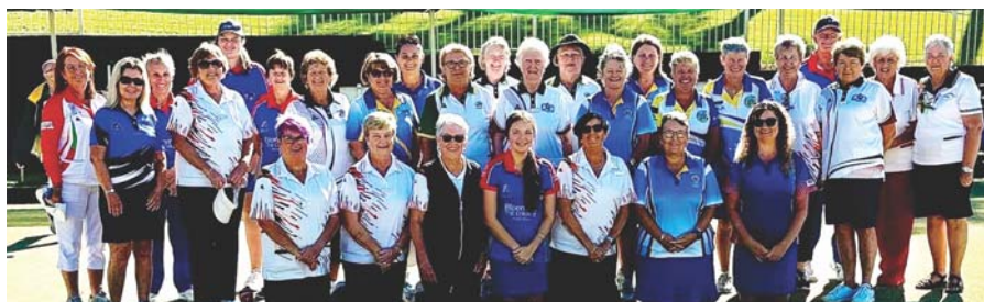
Above: Newcastle District Women's "City" Team