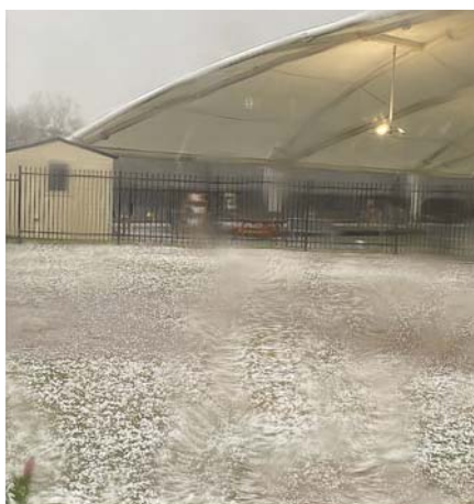
Above: Friendship Trophy vs LMDWBA at Belmont Golf & Bowls abandoned due to weather