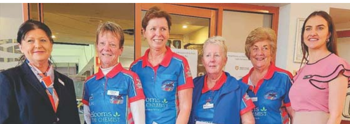
Above: Second Place Belmont Golf and Bowls Women's Invitation Day - Raymond