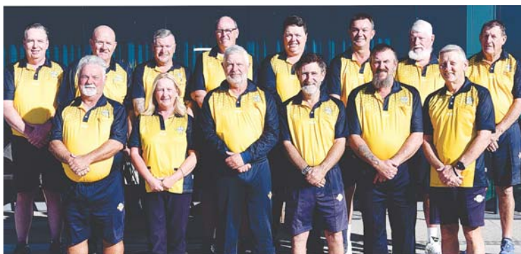
Above: Club Maitland City's 4 Grade side contesting the State Play-off.