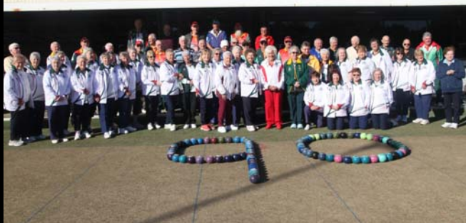
Above: Members and Visitors on the green for Lambton Park Women's 90 th Anniversary.