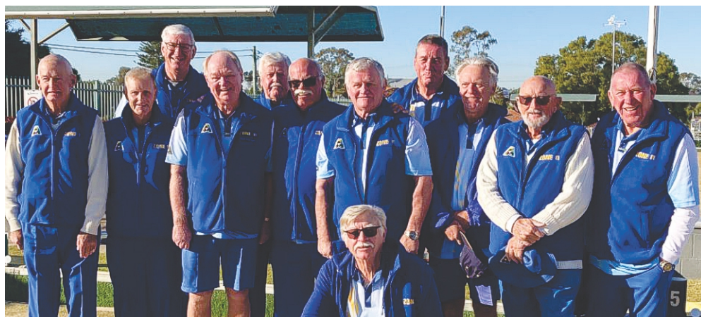
Above: 2023 Senior Interzone Representative Side