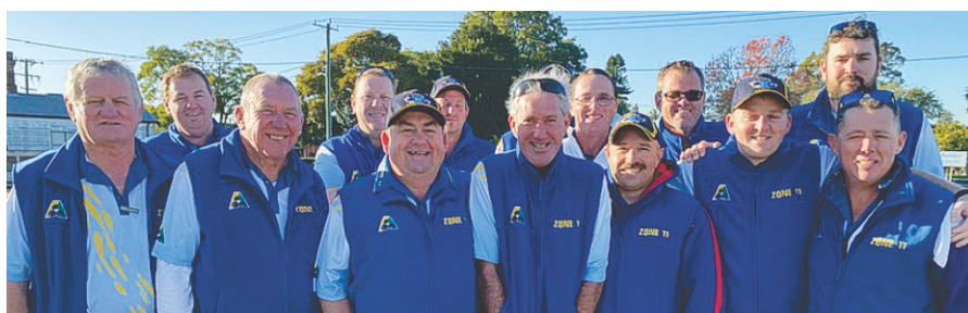
Above: 2023 Open Interzone Representative Side

2 result. This was enough for Harrington to win the title.