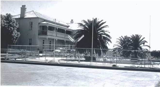
Above: Old Toronto Bowling Green at adjacent to Toronto Hotel

While we wait for the change in weather and our Championship matches to get on the way, we have been enjoying a few fun days on our green.