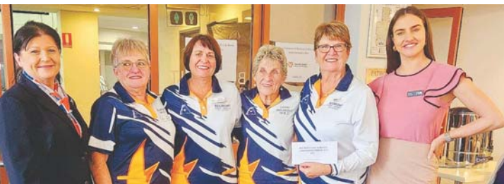
Above: First Place in Belmont Golf and Bowls Women's Invitation Day - Belmont

Happy Birthday to members celebrating in the month of July. Until August Report see you all on the Green.