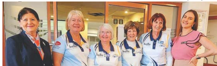
Above: Third Place Belmont Golf and Bowls Women's Invitation Day - Valentine